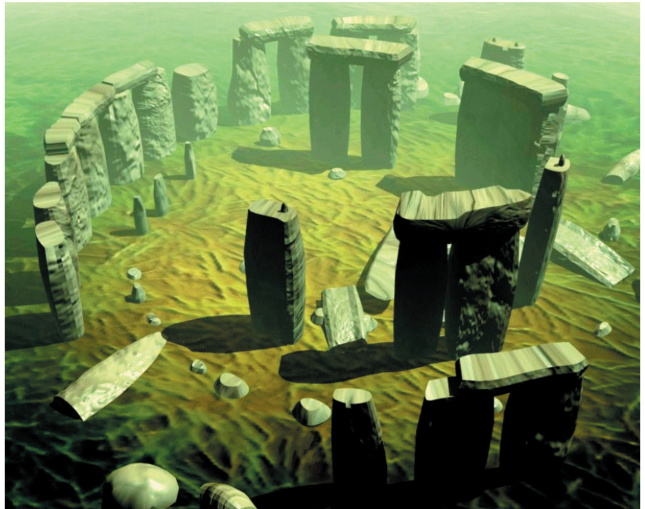
Imagen tomada de Internet. No ha sido posible lograr el nombre de su autor.

There are probably hundreds of myths and legends about Stonehenge. Various people have attributed the building of this great megalith to the Danes, Romans, Saxons, Greeks, Atlanteans, Egyptians,